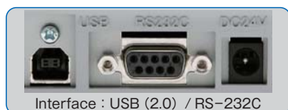
Interface : USB (2.0) / RS-232C